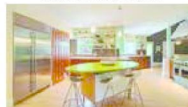
43 Prospect Street, Carlisle 2.01 acres Offered at $1,299,000

Call us to see our luxury portfolio of homes with multiple at-home work and learning spaces!