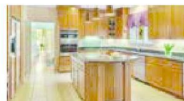
133 Hutchins Rd, Carlisle 2 acres Offered at $1,289,000