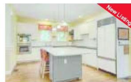
23 Buttrick Lane, Carlisle 2.08 Acres Offered at $1,409,000