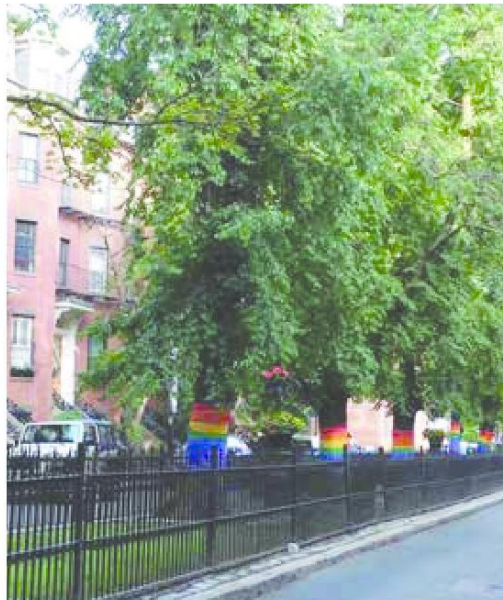
(Left) Bloom Couture Floral Studio, 769 Tremont Street. (Right) Concord Square.