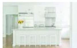
965 Bedford Rd, Carlisle 2.07 Acres Offered at $1,799,000