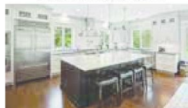
88 Hugh Cargill Road, Concord 2.87 acres Offered at $2,799,000