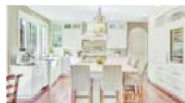
89 Davis Road, Carlisle 2.01 acres Offered at $1,509,000