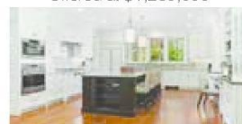
70 Squaw Sachem Trail, Concord .97 acres Offered at $3,699,000