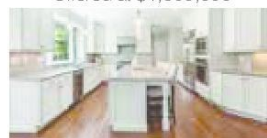
254 Monsen Road, Concord .49 acres Offered at $1,725,000