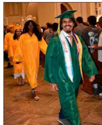
The Class of 2026 arrives for graduation.