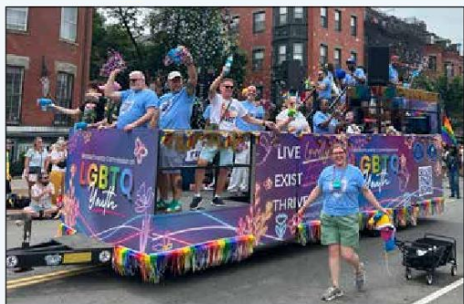
The Pride for the People parade made its way from Copley Square to Boston Common Saturday. 300 contingents, a million spectators, and a theme built for the moment: "Pride as Protest Since 1776."