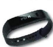
Pivotal Living™ Fitness Watch

We're celebrating Simply Free Checking with FREE Mobile Banking , FREE Online Banking and a FREE gift! Plus, up to $30** cash back and your chance to win a $500 Bella Santé Day Spa Gift Card or a $100 Phantom Gourmet Gift Card! Get in here March 18 th !