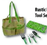
Rustic Life Gardening Tool Set with Tote