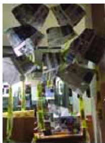
"Throwing Caution to the Wind," South End library's sample window installation on Tremont Street

While details of the Library Window Take-Over are being ironed out by FOSEL, Watson has done a simple installation of hand-made kites with colorful tails made of, among other things, yellow construction tape in the huge Tremont Street window at the library, with the theme of Throwing Caution to the Wind . On display are craft books about how to make kites, a harbinger of spring. Let it inspire you: Bring your own idea for another Tremont Street window installation to the