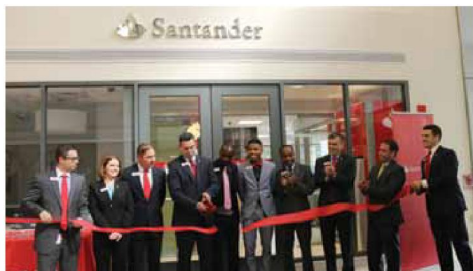
Ribbon cutting ceremony from Santander's Debut at BMC.

Since 2014, Santander has partnered with BMC as the official sponsor of Team BMC, the hospital's Boston Marathon team, raising money and awareness to support the hospital's Building the New BMC campaign, which will include the construction of a new, state-of-the-art Emergency Department. BMC is the busiest provider of trauma and emergency services in the region, with more than 130,000 emergency department visits and more than 2,000 trauma admissions per year.