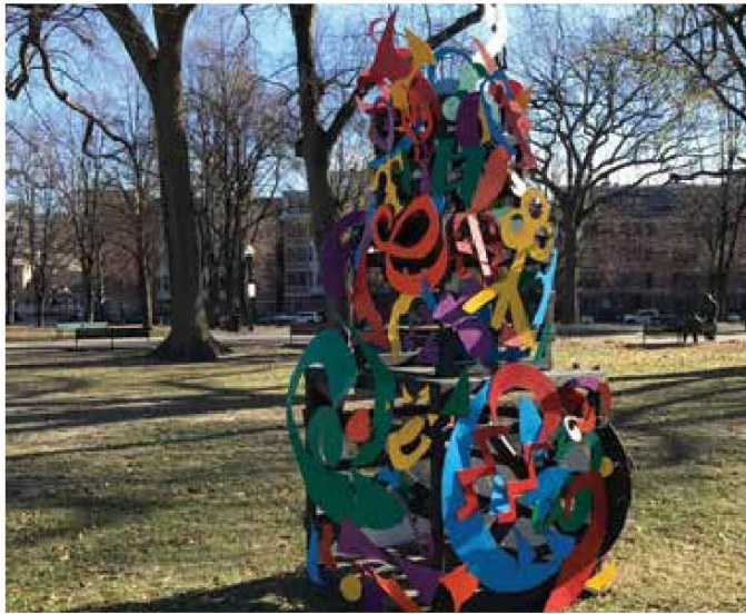
Emergence in Franklin Square

is envisioned as a communal tree of hope, built based on direct community input. Read more about the artist, the creation of the sculpture, and its meaning here http://www.bcaonline.org/visualarts/summer-public-art.html and here http://www.chanelthervil.com/emergenceblog/ .