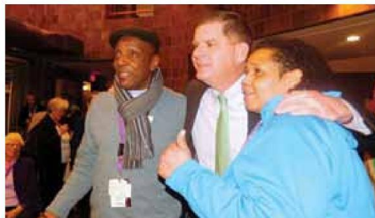
Mayor Marty Walsh.