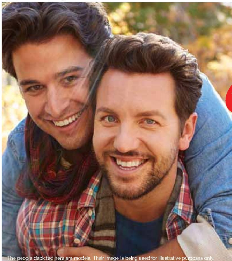
The people depicted here are models. Their image is being used for illustrative purposes only.

We are the future of the LGBT community.