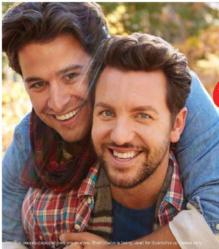
The people depicted here are models. Their image is being used for illustrative purposes only.