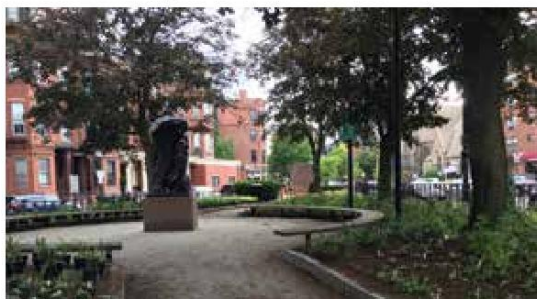
Continued on page 2 Harriet Tubman Park in the South End