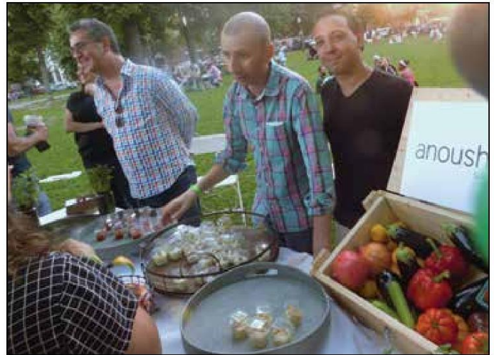
(Bottom Right) Anoush'Ella sample table.