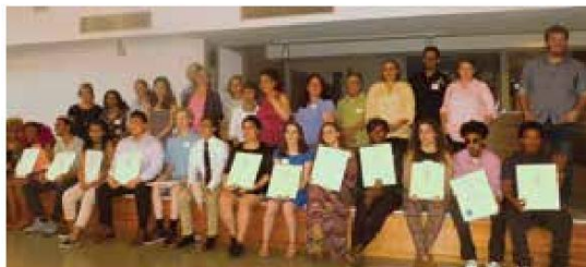
Continued on page 4 2017 B/FSNA scholarship recipients.

The Blackstone/Franklin Square Neighborhood Association (B/FSNA) scholarship committee gave out a total of $33,500 in awards to 12 rising high school seniors and three continuing college students at a reception on Tuesday, June 20 at