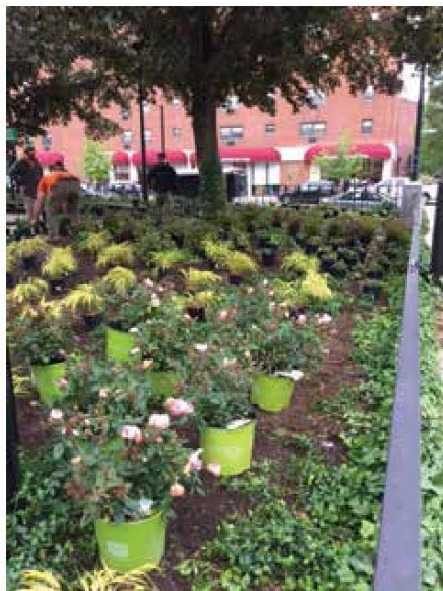
Harriet Tubman Park in the South End

The Tubman statue, is the first statue on city-owned property honoring a woman