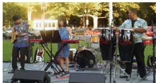
Carmelia Latin Jazz Band.