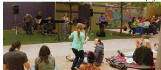
Warren Avenue Breakdown at Frieda Garcia Park.