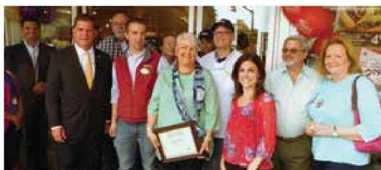
Foodie's staff, WGMS board members

As part of the Boston Main Streets Awards program, Mayor Martin J. Walsh and the Office of Economic Development joined Washington Gateway Main Street (WGMS) in honoring Foodie's Urban Market, 1421 Washington Street, with the Business of the Year Award on Wednesday, June 28. The Mayor's stop at Foodie's was part of a multi-day trolley tour of the Main Street business districts at which he recognized outstanding businesses