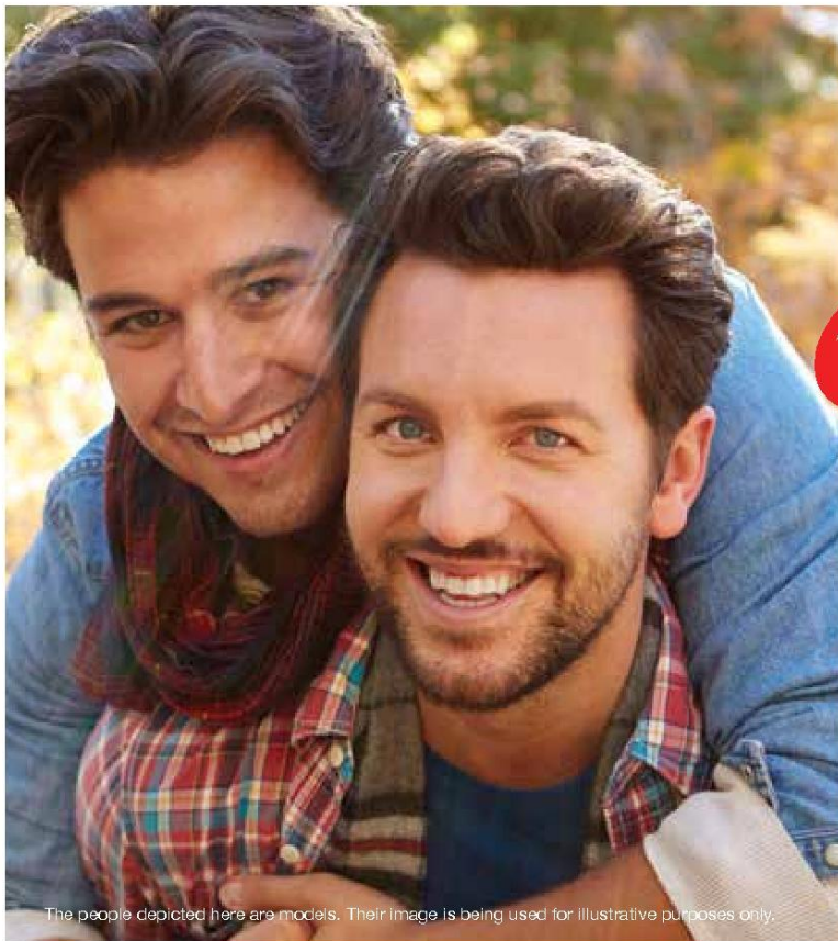
The people depicted here are models. Their image is being used for illustrative purposes only.

We are the future of the LGBT community.