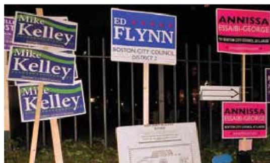
Outside Benjamin Franklin Institute of Technology.