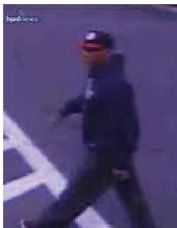
Person of Interest

On Monday night at about 8:05 pm, Boston Police responded to a call for shots fired in the area