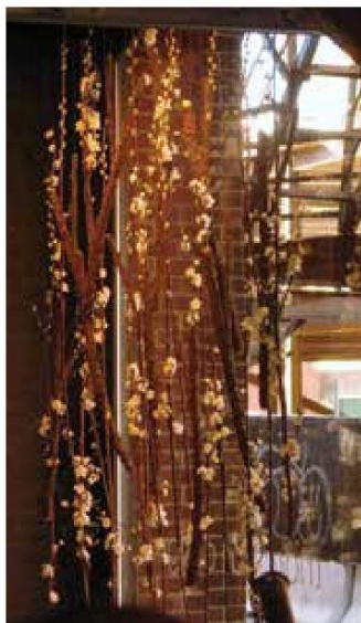
Window décor from fallen tree.

Self-taught in design and formally educated in horticulture and landscape design, Hall was working in a restaurant in the mid-1980s when he took a job at a family-owned florist shop in the Concord area. Frustrated with the 1950s and 1960s-rooted aesthetics and inventory of the business, including the