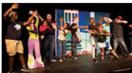
True Colors Troupe

"Extra Terrestres" (2016)—written and directed by Carla Carina—chronicles the intimate journey of iconic urban movement figure Vico C. The film stretches from Vico's childhood to international renown. Carina also means to have the perceived as a metaphor for all human beings. "Sin Va-