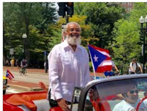
Paid for and authorized by the Byron Rushing Committee.