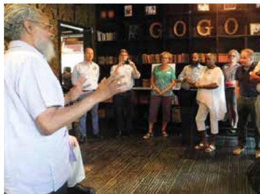
Rep. Byron Rushing addresses the crowd.