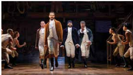
The cast of "Hamilton."