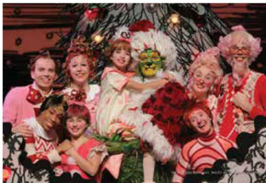
A scene from "Dr. Seuss' How the Grinch Stole Christmas"