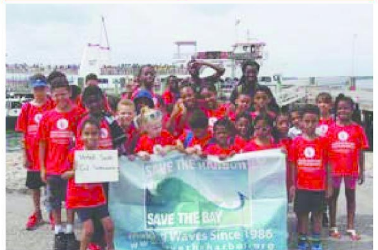
A group of 34 youth and teens from United South End Settlements spent a day on Georges Island in Boston Harbor