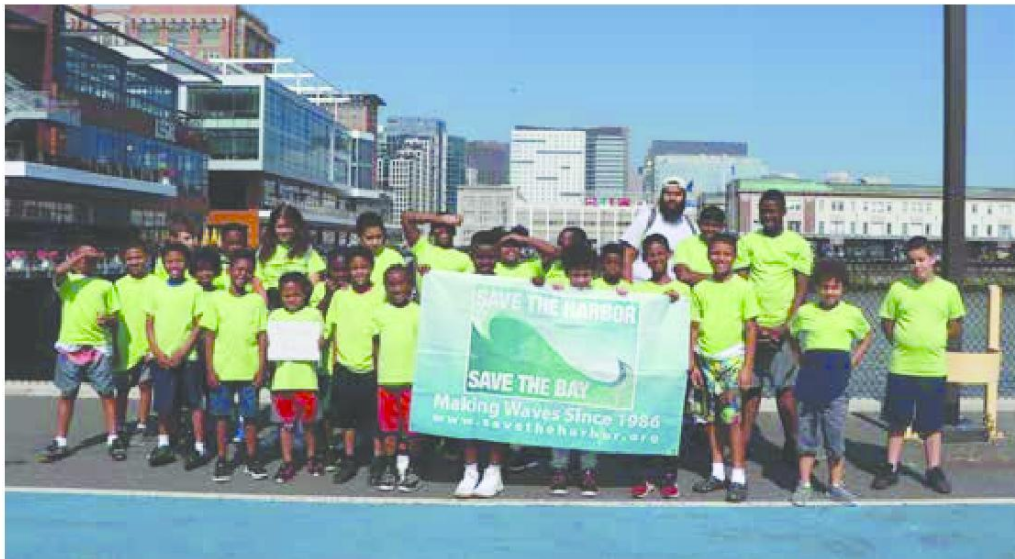
A group of 39 youth and teens from the Salvation Army South End spent a day on Georges Island in Boston Harbor.

For more information about Save the Harbor/Save the Bay, visit their website at www.savetheharbor.org , their blog Sea, Sand & Sky at www.blog.savetheharbor.org or follow their social media @savetheharbor.