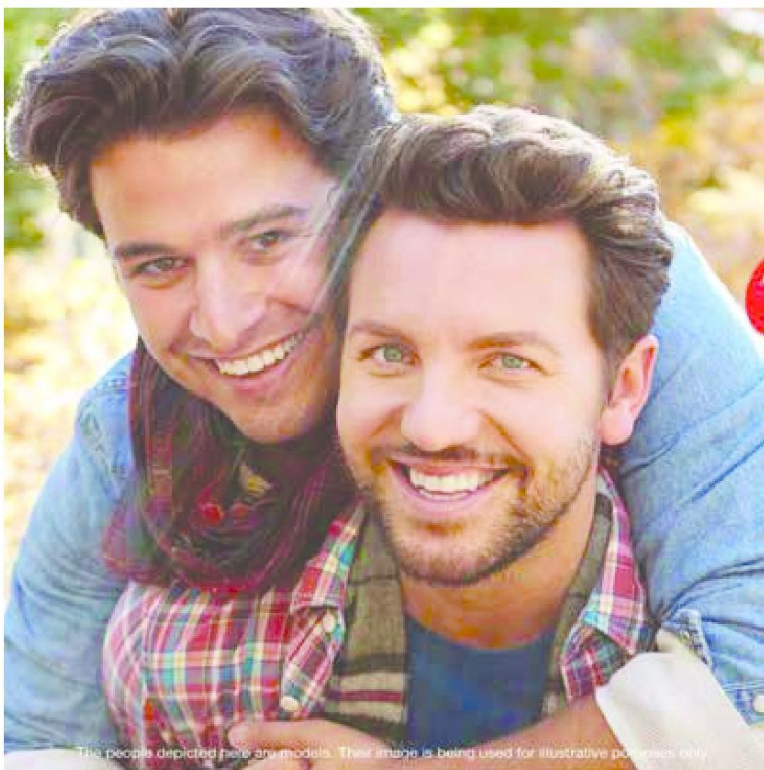
The people depicted here are models. Their image is being used for illustrative purposes only.

We are the future of the LGBT community.