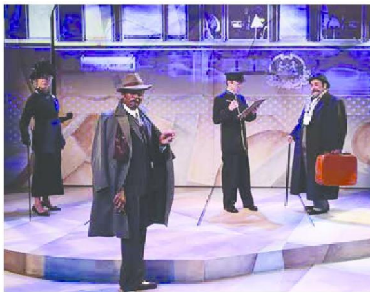
Lyric Stage Company of Boston production of "Agatha Christie's Murder on the Orient Express."