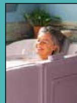
Comfort & Safety