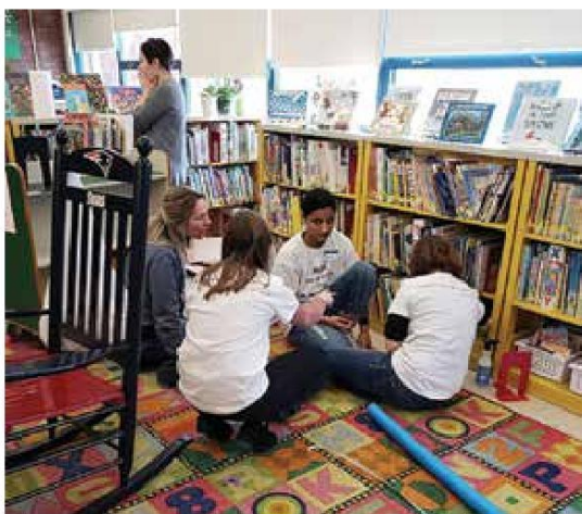
Volunteers improve the library at the Blackstone School during the 2019 MLK Day of Action.