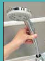
Hand Held Shower