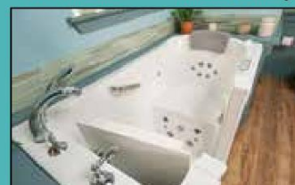
44 Hydrotherapy Jets

Only American Standard has OVER 140 years of experience and offers the Liberation Walk-In Bathtub.