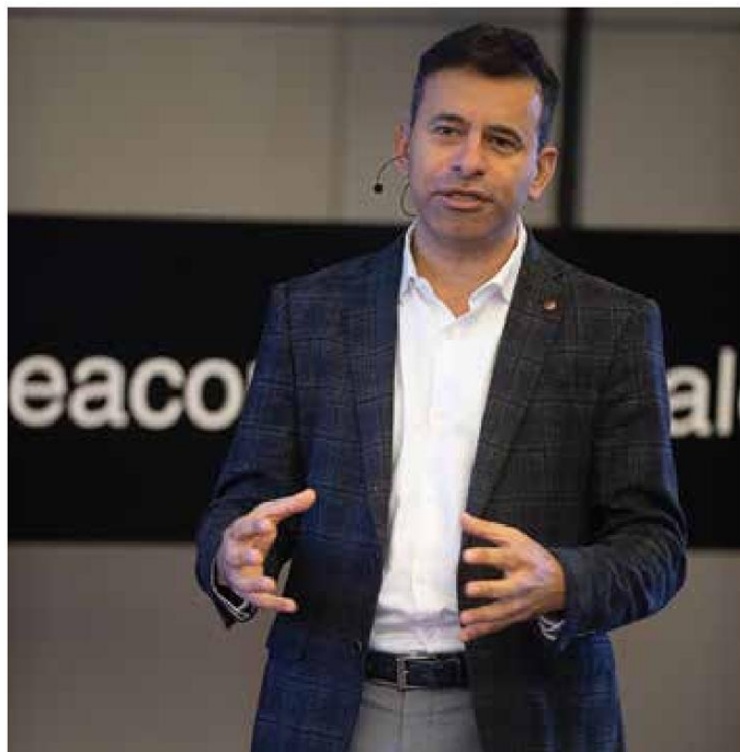
Marty Makary, chief of Johns Hopkins Islet Transplant Center and health policy advocate

Johns Hopkins, the Albert Einstein College of Medicine, and the US Digital Service and Centers for Medicare & Medicaid Services. All talks were recorded and will be shared on the TEDx platform.