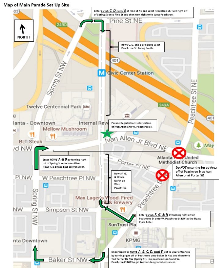
Atlanta Pride Parade Assembly Area Street Information