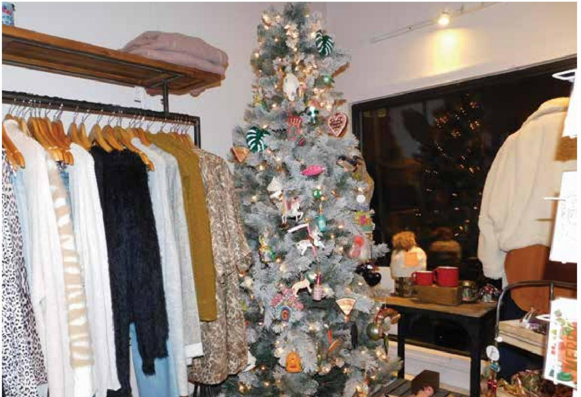
(Top) Inside Table and Tulip, 461 Shawmut Avenue. (Bottom) Inside Flock, 274 Shawmut Avenue.