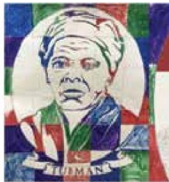
Artwork created by the children of USCS. Visit www.uscs.org for more information and registration.