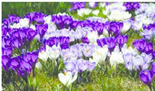
Hokus Crocus adorn the Library Park gardens and usher in spring.