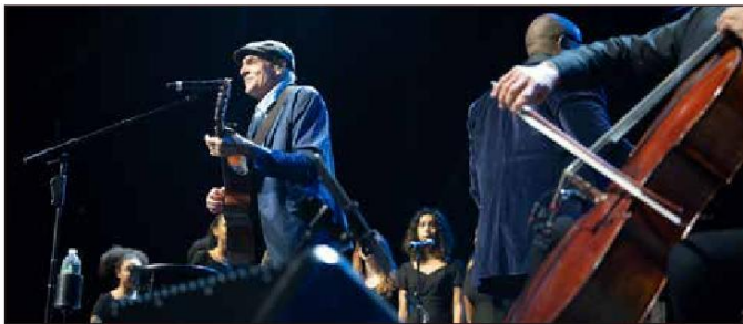
James Taylor performing with BAA's Spiritual Ensemble.

Several other well-known artists, performers, designers and philanthropists were honored at the event with a special guest performance from singer and songwriter James Taylor. BAA students performed with musician James Taylor. In total, $1.65 million was raised to benefit Boston Arts Academy students.