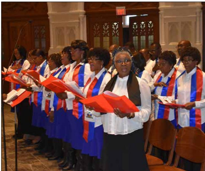
The Haitian choir.