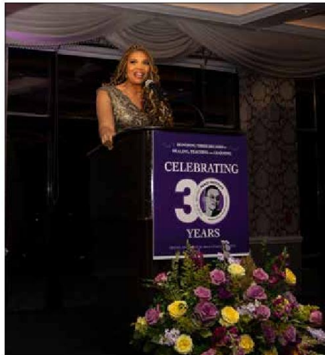
NBC Boston Anchor Latoyia Edwards, Emcee.