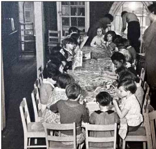
Students craft with one another at Ellis Memorial & Eldredge House (now Ellis Early Learning) in the South End in 1973.