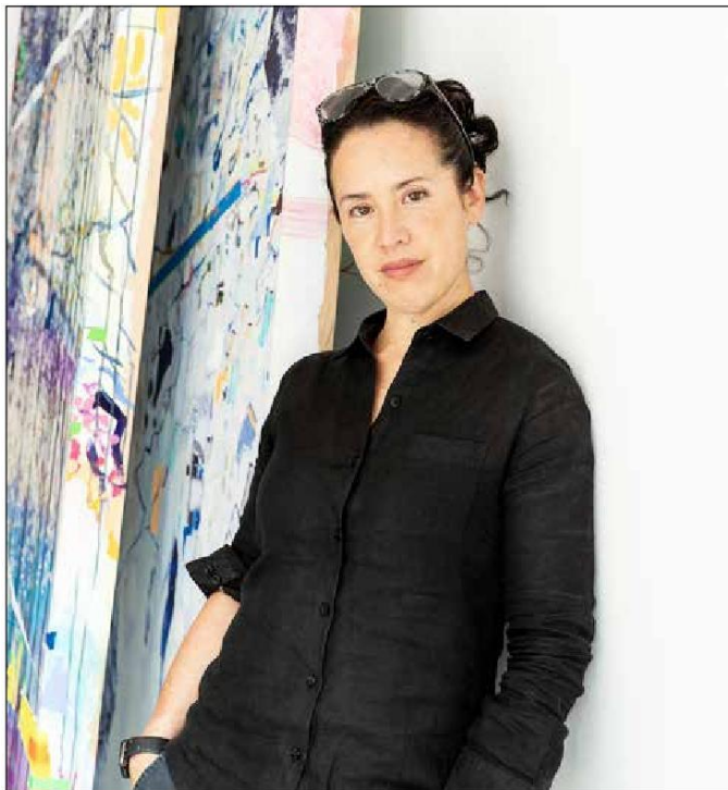
Sarah Sze.

Sarah Sze gleans objects and images from worlds both physical and digital, assembling them into complex multimedia works that shift scale between microscopic observation and macroscopic perspective on the infinite. A peerless bricoleur, Sze moves with a light touch across proliferating media. Her dy-