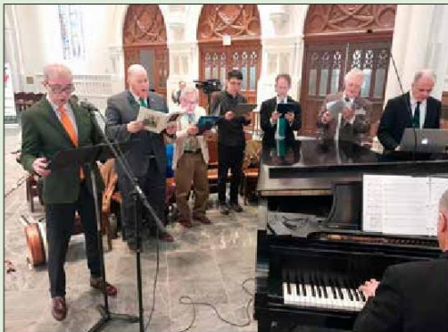
Choir singing away.