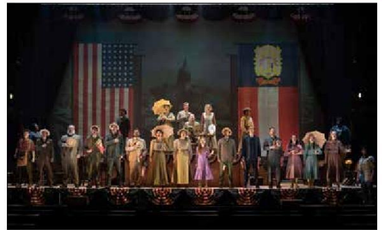
Cast of the National Tour of 'Parade' at the Emerson Colonial Theatre.

Parade, Broadway tour at Emerson Colonial Theatre, Boston, through March 23. Emersoncolonialtheatre.com .