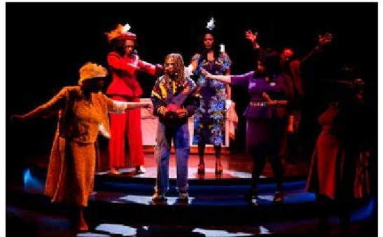
The company of Moonbox Productions staging of "Crowns" at Arrow Street Arts.

CROWNS, Moonbox Productions at Arrow Street Arts, Cambridge, through May 4. moonboxproductions.org