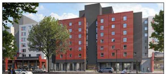
Rendering of completed project. Courtesy photo.