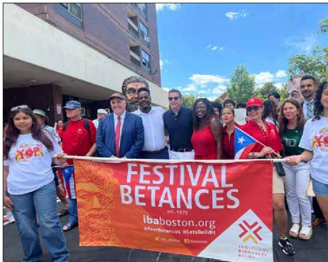
Festival Betances 2025.