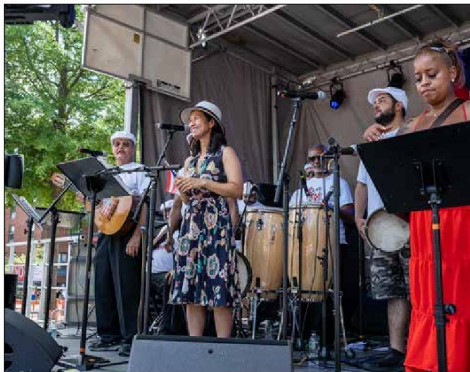
Festival Betances 2025.