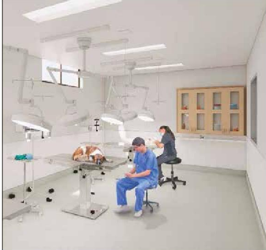
Rendering of the inside of the new facility at 10 Chandler St. in Boston.