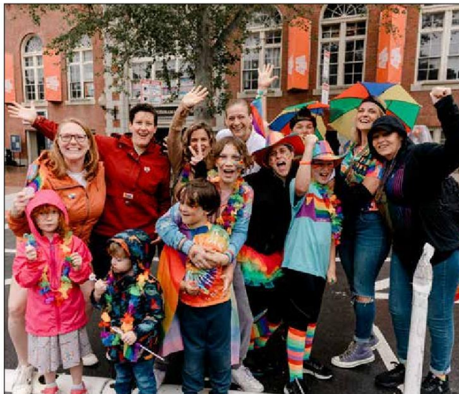
Boston Pride 2025.

Look for Part Two: elections, restaurants, development, and the recognitions that shaped the South End in 2025 in the Jan. 8, 2026 edition of South End News or online now at mysouthend.com