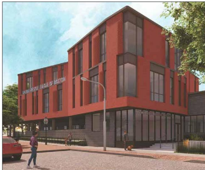
Rendering of the new facility at 10 Chandler St. in Boston.

Written with information provide by Mass-Development.