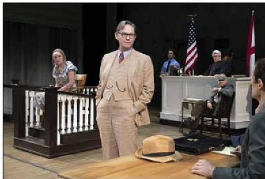
Richard Thomas as Atticus Finch (center) in Broadway tour of Aaron Sorkin's adaptation of "To Kill a Mockingbird"

Plays adapted from seminal novels are always a great challenge, and Harper Lee's iconic novel "To Kill a Mockingbird" is all the more so. After all, Gregory Peck earned a best actor Oscar in the fine 1962 film with a performance that brought gravitas and singular stature to Alabama lawyer Atticus Finch. Recently