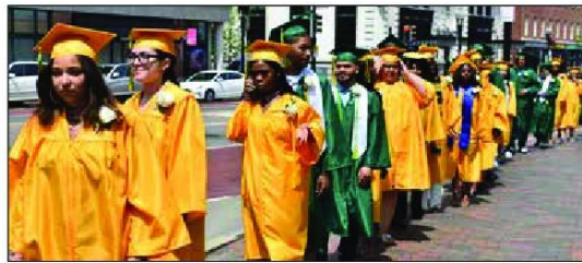
Here comes the Class of 2022 arriving for the 91 commencement on Saturday, May 21, 2022 outside the Cathedral of the Holy Cross.