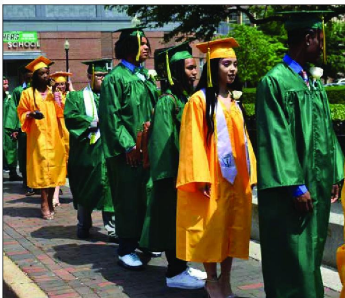
Here comes the Class of 2022 arriving for the 91 commencement on Saturday, May 21, 2022 outside the Cathedral of the Holy Cross.