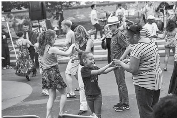
2016 Tito Puente Latin Music Series

July 7. Created in honor of Latin music icon Tito Puente, this series celebrates 15 years of bringing live Latin music with a strong salsa influence to Boston parks. The series is sponsored in part by Berklee College of Music, and Inquilinos Boricuas en Accion. Free salsa lessons are led by MetaMovements