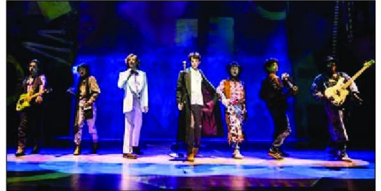
Cast members of Sing Street; photo: Evan Zimmerman/MurphyMade.

Sing Street , pre-Broadway production by The Huntington in association with Sing Street Broadway L.L.C., Calderwood Pavilion, through October 9. 617-266-0800 or huntingtontheatre.org