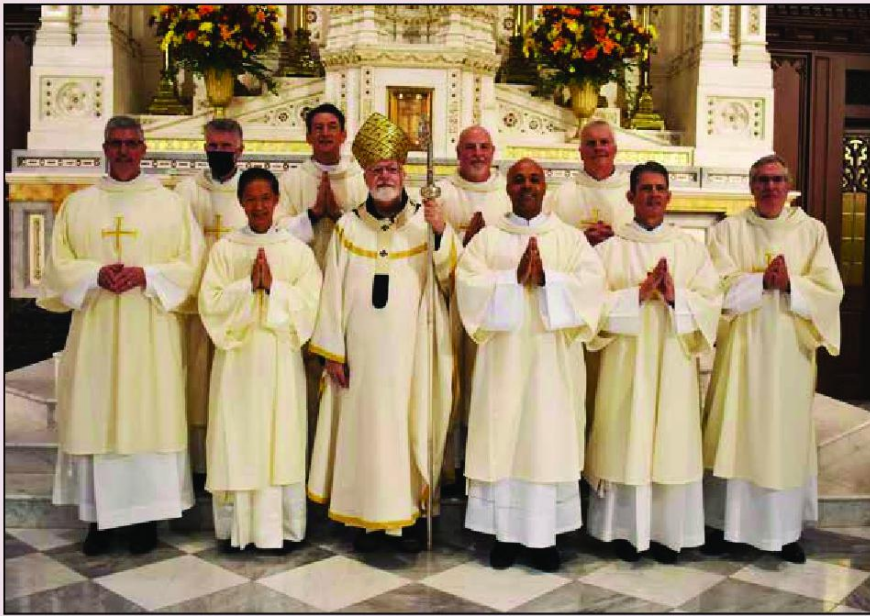
Cardinal O'Malley joins with nine new deacons for a group photo at the Cathedral on Saturday, October 15, 2022 after the ordination Mass. The new deacons come from all over the Archdiocese and will be assigned to parish duties.