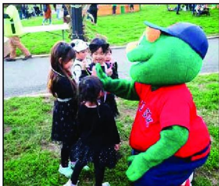
Wally the Green Monster greets youngsters at the October 21 Fall-o-Ween children's festival hosted by the Boston Parks and Recreation Department on Boston Common with support from H.P. Hood LLC.