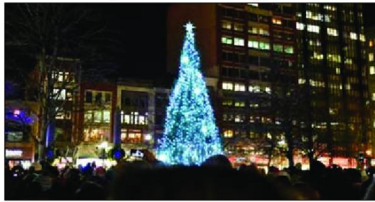
Copley Square, photo via boston.gov.