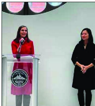
All photos courtesy of Ellis Early Learning.