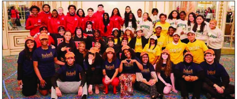
Students Represent 11 Boston Public Schools; Reside in Dorchester, East Boston, Hyde Park, Jamaica Plain, Mattapan, Roxbury, the South End, and West Roxbury.