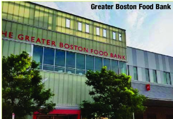
Greater Boston Food Bank

Greater Boston Food Bank (GBFB) partners with 500+ hunger-relief agencies, including food pantries, community meal programs and other food assistance providers throughout the nine counties and 190 towns and cities across Eastern Massachusetts. These