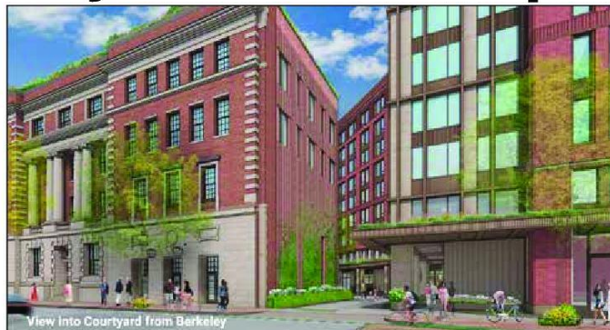
View into Courtyard from Berkeley