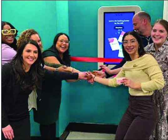
Ribbon-cutting ceremony commemorating the installation of the new S.O.S. vending machines at City Hall.