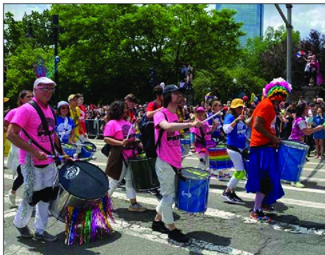
Boston Pride Parade 2023.