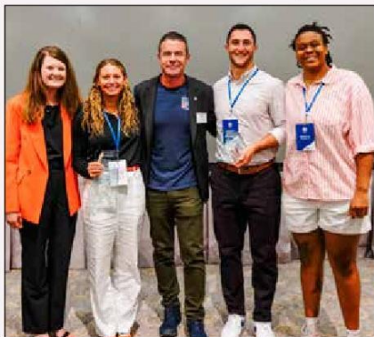
Boston-based nonprofit hosted the awards presentation at the annual Fellowship Summit honoring the fellows' outstanding work with Team IMPACT.