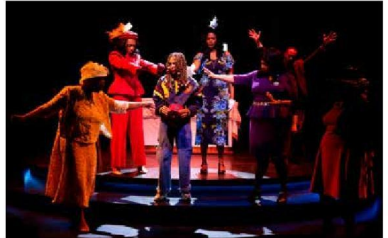
The company of Moonbox Productions staging of "Crowns" at Arrow Street Arts.

CROWNS, Moonbox Productions at Arrow Street Arts, Cambridge, through May 4. moonboxproductions.org