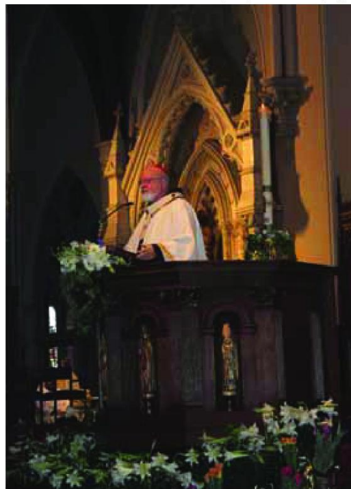
(Left) Easter at the Cathedral (Center) Cardinal O'Malley greeting people after Mass (Right) Cardinal O'Malley preaching