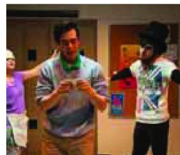
Students rehearsing in "Speech and Debate"

As the three thoughtful iconoclasts come together at the school's new Speech and Debate club, they form an unusual Three