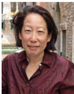
Gish Jen.

The first paragraph in the New York Times review of The Resisters describes a searing picture of a world we hope we will never see but which conceptually appears increasingly close at hand: The Resisters "... imagines a society even more catastrophically divided than our own.