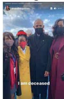
Amanda Gorman's Instagram account in the moment while suggesting a future America can become.

Gorman was tasked to write on the inauguration's theme, "America United." It was a tall request to fulfill given the civil unrest of last summer and the recent Capitol siege. However, Gorman being an extraordinarily confident and gifted writer, delivered, crafting a poem—part personal, political, and prophetic. The poem spoke honestly