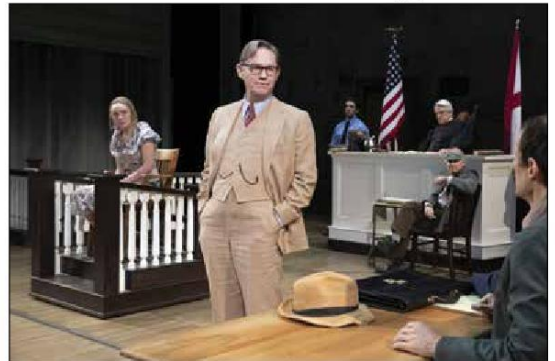
Richard Thomas as Atticus Finch (center) in Broadway tour of Aaron Sorkin's adaptation of "To Kill a Mockingbird"

Plays adapted from seminal novels are always a great challenge, and Harper Lee's iconic novel "To Kill a Mockingbird" is all the more so. After all, Gregory Peck earned a best actor Oscar in the fine 1962 film with a performance that brought gravitas and singular stature to Alabama lawyer Atticus Finch. Recently