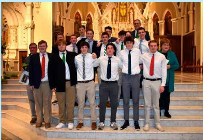
Boys from Catholic Memorial took part in the Mass and helped distribute shamrocks after to the crowd.