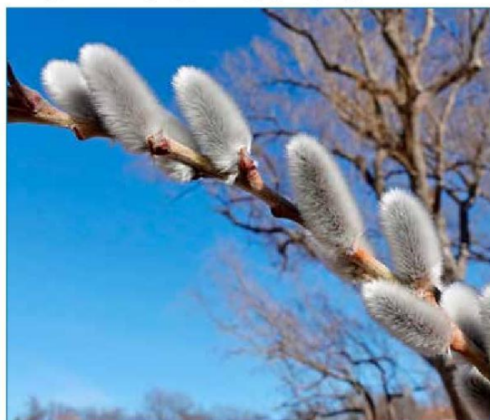
Catkin of rosegold pussy willow before flower emergence.